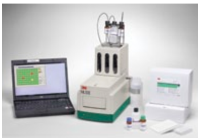
3M™ Microbial Luminescence System II (MLS II)